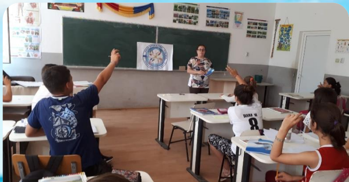
SECONDARY SCHOOL NUMBER 1, RASOVA