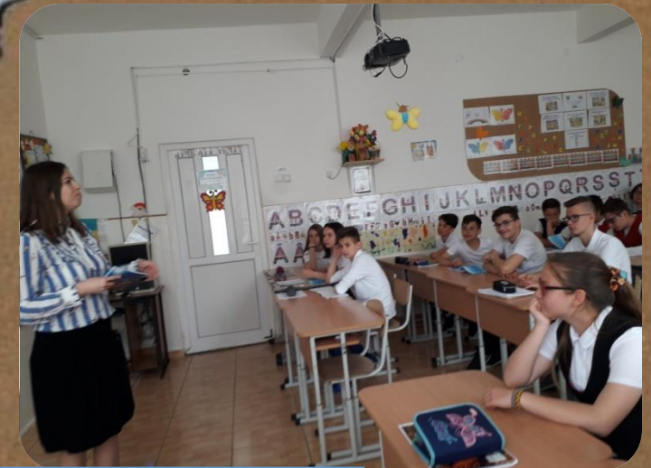
Biology (7 th grade)