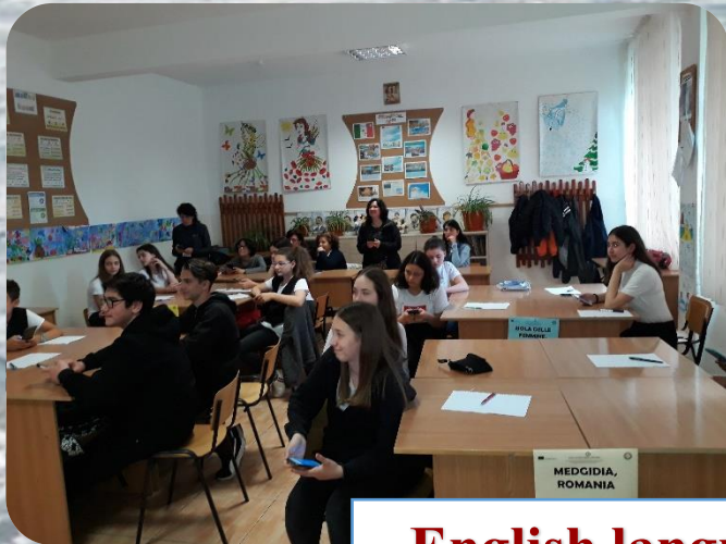
English language (7 th grade)