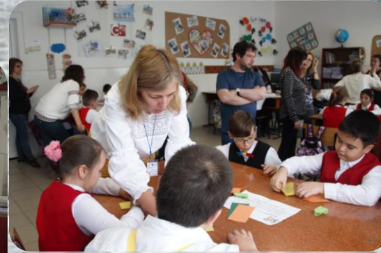
Step by Step (3 rd grade)